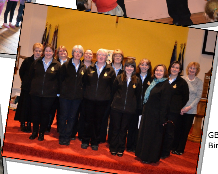
GB 90th Birthday Party