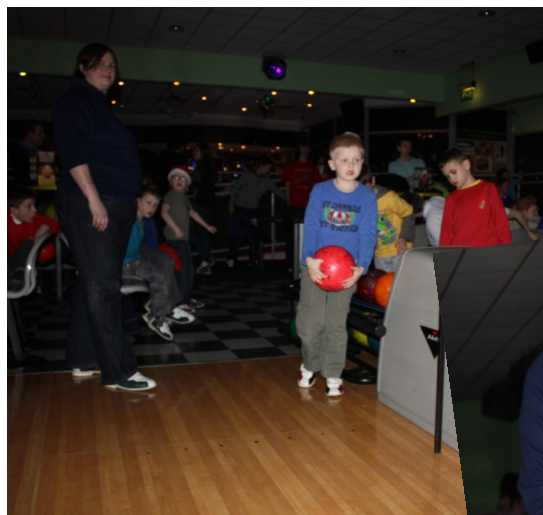
Boys Brigade Christmas Bowling trip