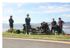
Having a break