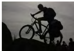
Cycling in the BB