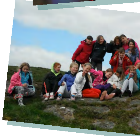
GB trip to Low Port