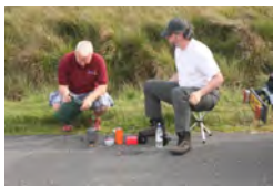
The support brew