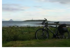
Pladda & Ailsa Craig