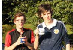
That tastes good!