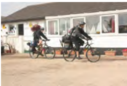
Back on the road