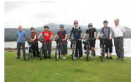
Finished, well done!

By the time you read this Christmas will be almost upon us. The BB stops on December the 10 th when we have our Christmas party for the Anchor Boys and a night at Laser tag for everyone else.