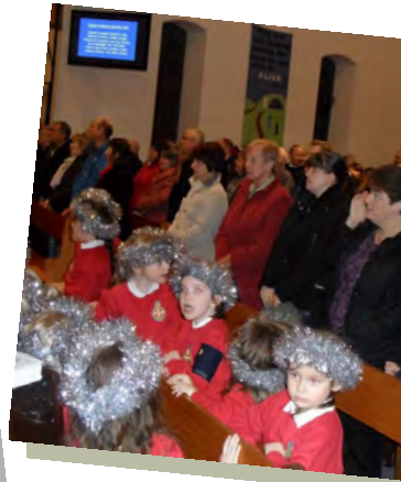
GB Carol Concert 20