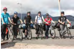
Ready for the off

As mentioned in a recent letter to parents, after cycling all over Fife for two weekends trying to get fit, 6 of our seniors travelled to Arran on the west Coast in August and successfully completed a Duke of Edinburgh Silver Cycling Expedition. Well done lads. A picture tells a thousand words: