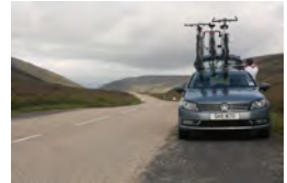
Where are they?