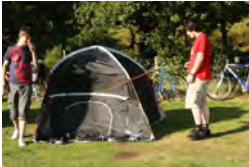
How does this go again? Exhausted!!