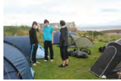
1 st Camp