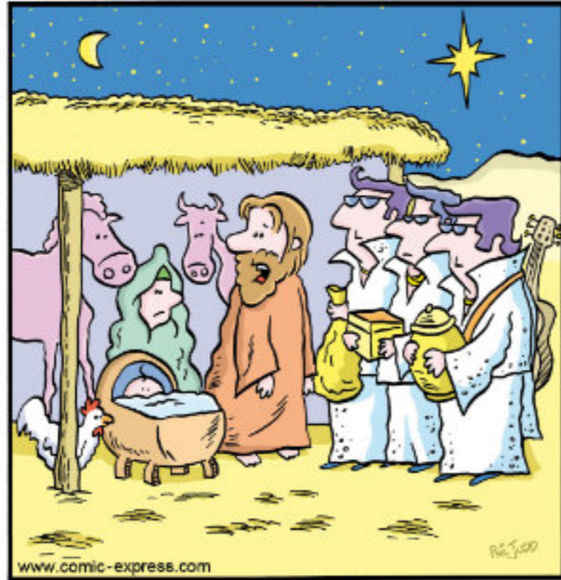
"They say they are three kings."